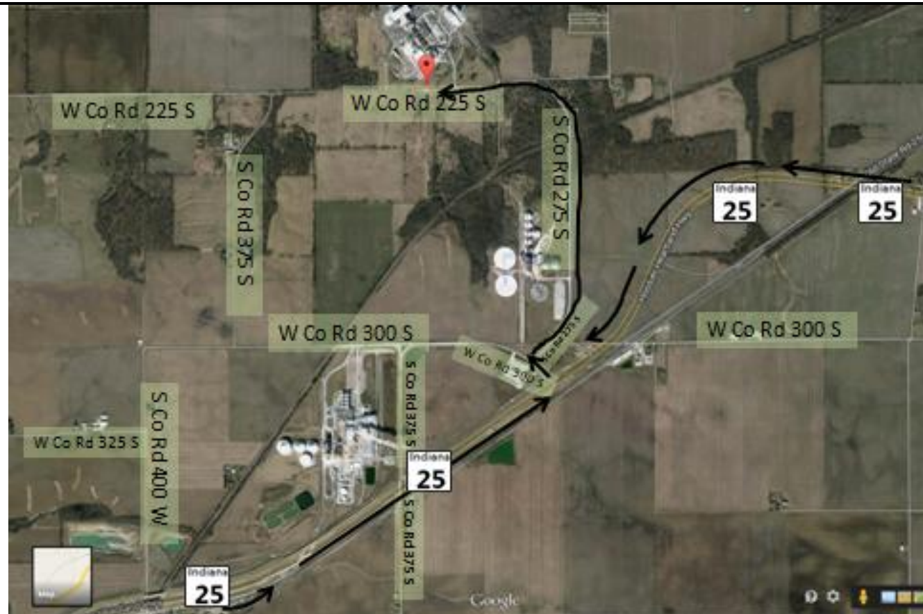
The above blow up picture covers the area marked in the map on the previous page with a number 2.