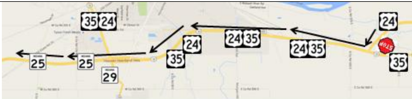
The above blow up map covers the area marked in the map on the previous page with a number 1.