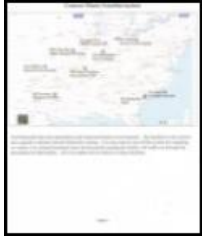
Cement Plant Booklet