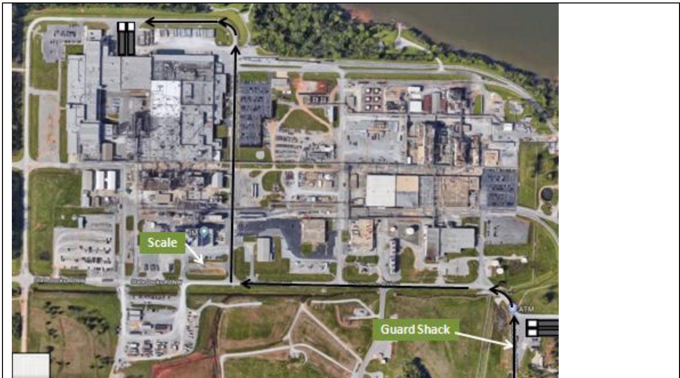
The trucks that I added to this picture are oversized so you can see them. When you get there you will have plenty of room to turn around and get in the dock.